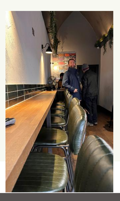
Despite it's small size the taproom boasts 24 craft beer taps

The Tasting Room, as they like to call it, has an impressive selection of 24 keg taps mainly dispensing Vault City sour beers and stouts and a couple of guest beers. With the Vault City brewery only a short distance away in Portabello, the very latest and freshest VC modern sours were available on draft. In addition, a well–stocked fridge offers additional cans of VC beers together with a limited range of guest cans. With space at a premium it is advisable to book in advance, but walk-ins are welcomed if there is room inside!